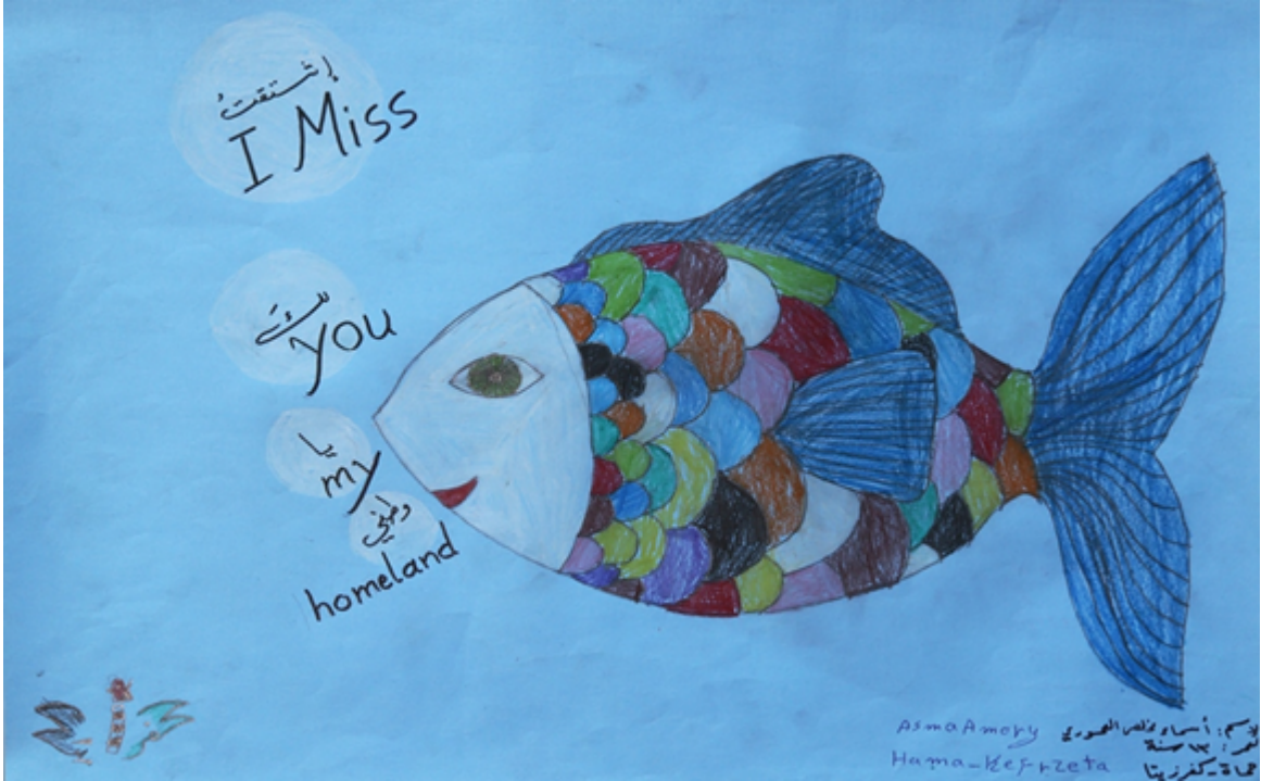
A photo drawn by a Syrian child.

unlock the benefits of migration and human mobility for the sustainable development of all.