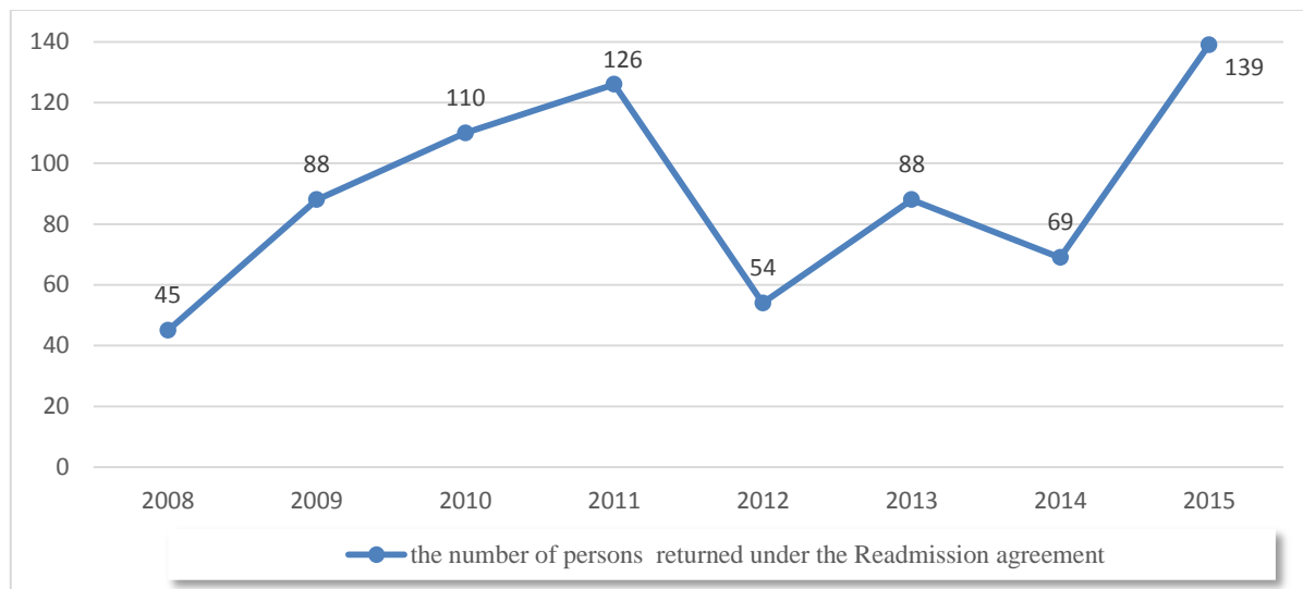
Fig. 1. The annual number of Moldovan citizens returned as a result of readmission